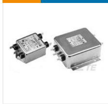
6VV1=F7251 S0 6VV1